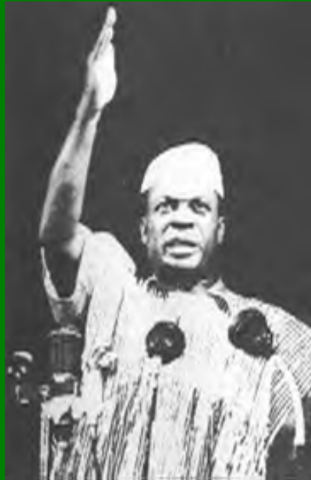
Dr. Kwame Nkrumah at Ghana Independence Celebration