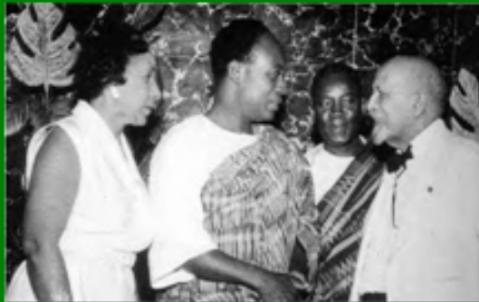
Marcus Garvey and Dr. Nkrumah with W.E.B DuBois and Dr. Shirley Graham DuBois