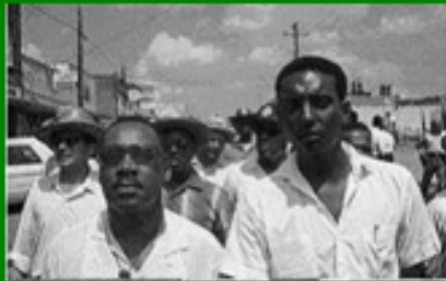
Kwame Ture in 1966, Kwame Ture with Dr. Nkrumah and Dr. Shirley DuBois, and Kwame Ture with Dr. King