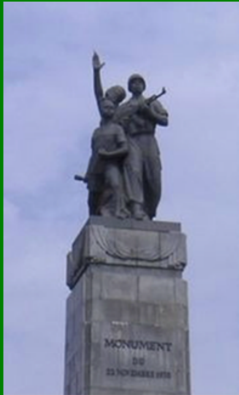
Monument commemorating the defeat of Portuguese invasion of Guinea in 1970.