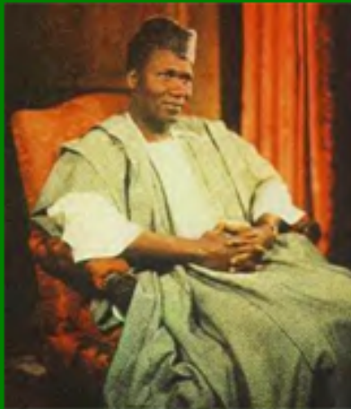
Dr. Kwame Nkrumah and Seku Ture