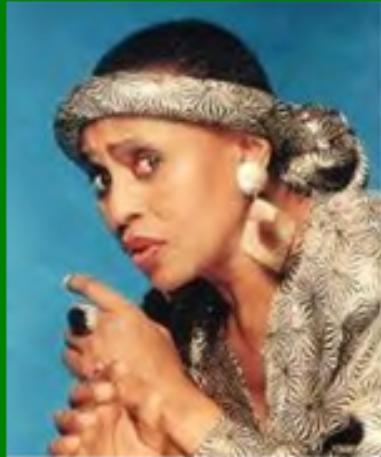
Mangaliso Robert Sobukwe and Miriam Makeba