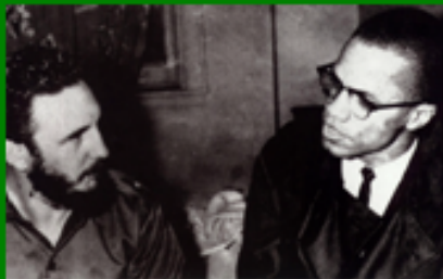
Dr. Nkrumah, Seku Ture and Malcolm X with Fidel Castro