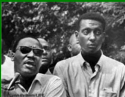
Dr. Martin Luther King with Dr. Nkrumah, Malcolm X and Kwame Ture